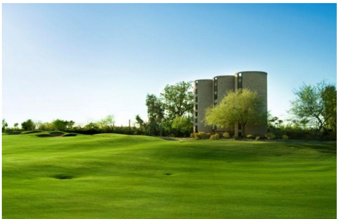
Silos from the Heard Plantation, the land on which Legacy was built, sit aside the 18<sup>th</sup> hole.