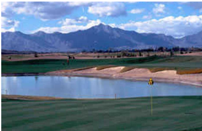
The view from the 18th across the water to the 9th hole at Aguila.